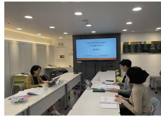
Office Assessment from KAB (Oct., 2023)