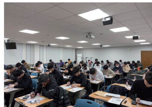
Certification examination (Nov., 2023)