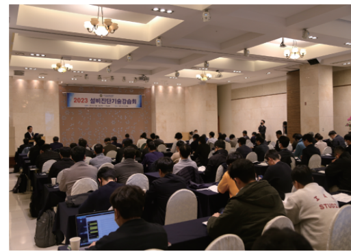
KCIMD Training workshop (Mar., 2023) (1)